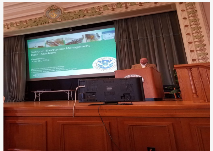
FEMA—Emergency Management Institute (EMI) Emmitsburg MD