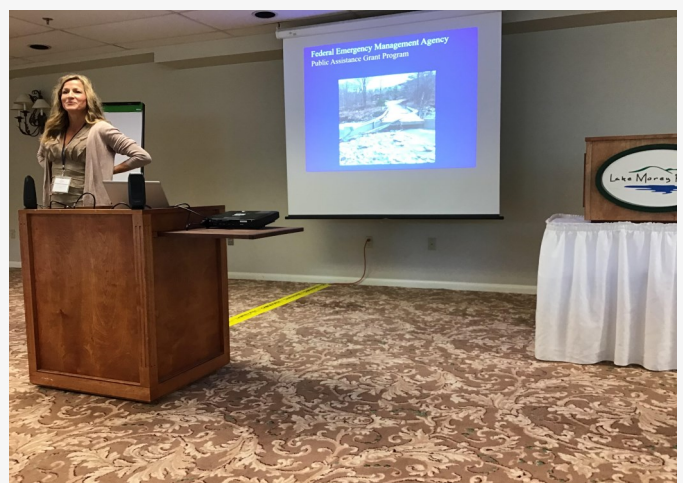
State of Vermont OEM Public Assistance Grant Program Fairlee VT