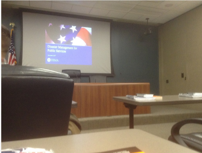
Disaster Management for Public Services (MGT317) Great Neck NY