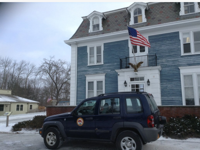
Winter Storm Activation Lewisboro Town Hall South Salem NY