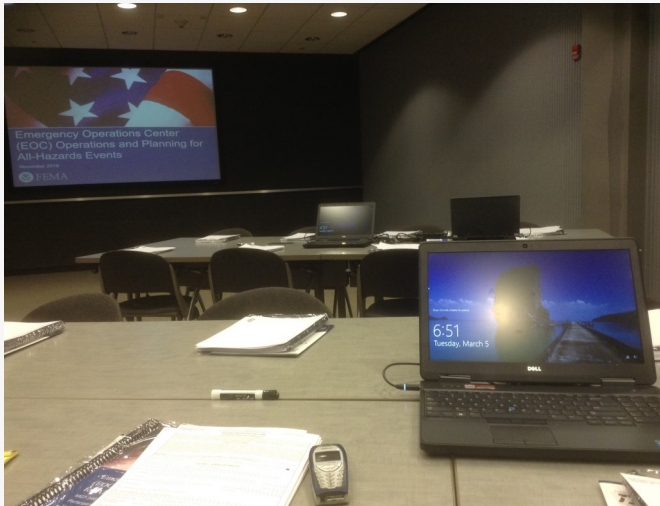
EOC Operations And Planning For All-Hazards Events (MGT-346) Nassau County OEM Bethpage NY