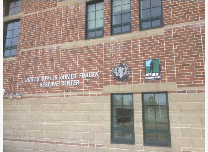
US DHS Active Shooter Workshop Vermont National Guard Westminster VT