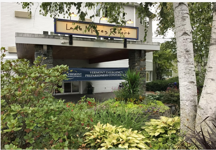
State of Vermont OEM Preparedness Conference Fairlee VT