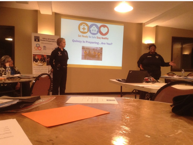
Community Preparedness All Hazards Training Quincy OEM Quincy MA