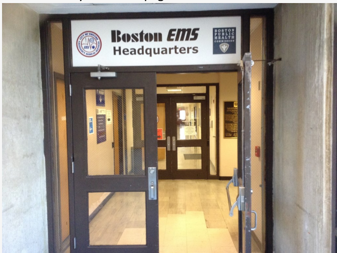
Advanced ICS Command and General Staff-Complex Incidents (ICS-400) Boston EMS Headquarters Boston MA