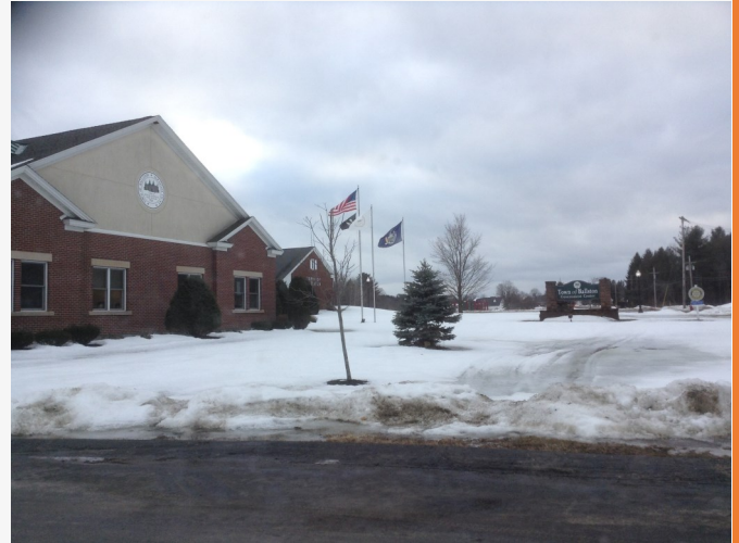
Emergency Operations Center Management Training Ballston Town Hall Ballston Spa NY