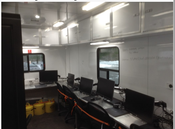
NYSEG Mobile Incident/Operations Command Post Brewster NY