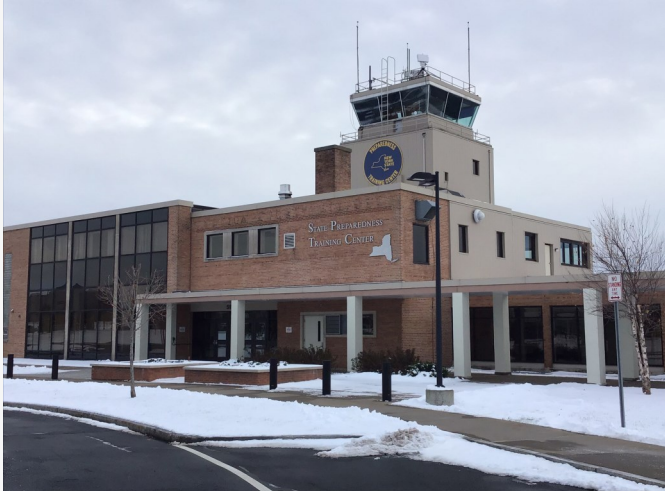
Seminar—Managing Chaos: Boston Marathon Bombing NYS Preparedness Training Center Oriskany NY