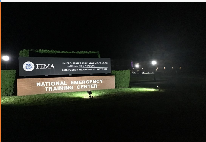
FEMA—Emergency Management Institute (EMI) Emmitsburg MD