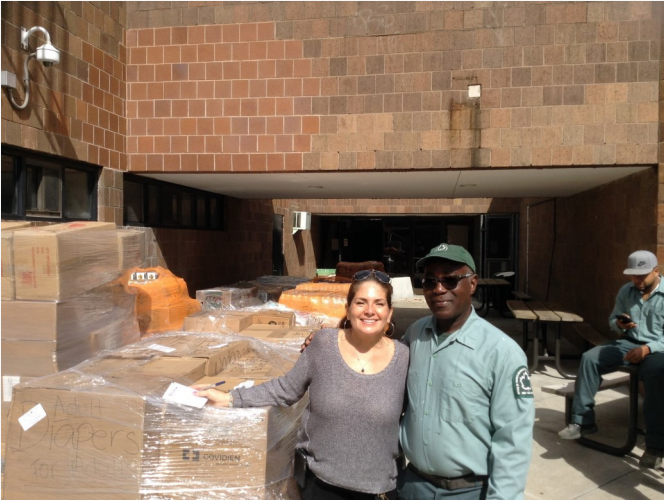
Logistical/Supply Chain Support—Hurricane Maria Roberto Clemente State Park Bronx NY