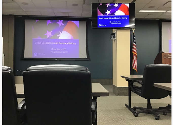
Crisis Leadership & Decision making Northwell Health Training Center Great Neck NY