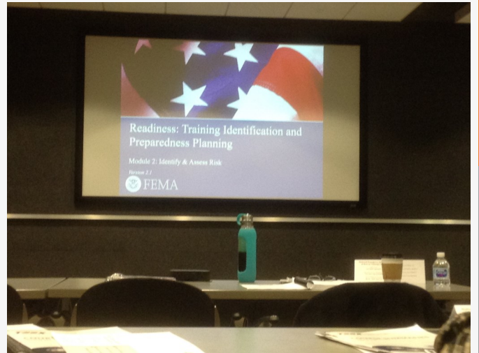
Readiness: Training Identification & Preparedness Planning (MGT-418) Nassau County OEM Bethpage NY