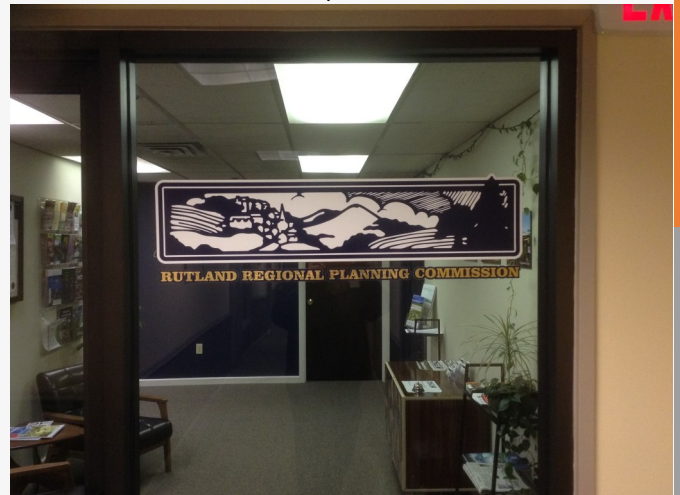
Regional Emergency Management Training Rutland Regional Planning Commission Rutland VT